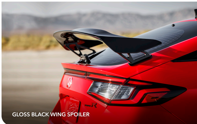
GLOSS BLACK WING SPOILER