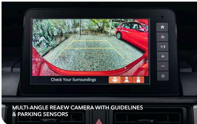
MULTI-ANGLE REAR CAMERA WITH GUIDELINES & PARKING SENSORS