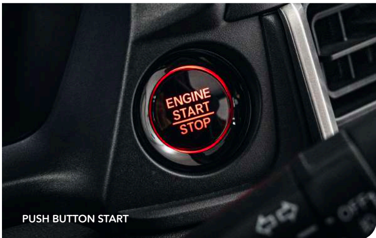
PUSH BUTTON START